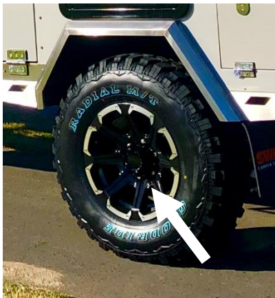
No wheel nut indicators

To check your nuts are tight, simply check the nuts with a 19mm wheel nut lever or torque wrench (setting 125). Do not over tighten or use a rattle gun. A quick way to monitor wheel nut movement is to purchase wheel nut indicators. These are available from SWAG direct.