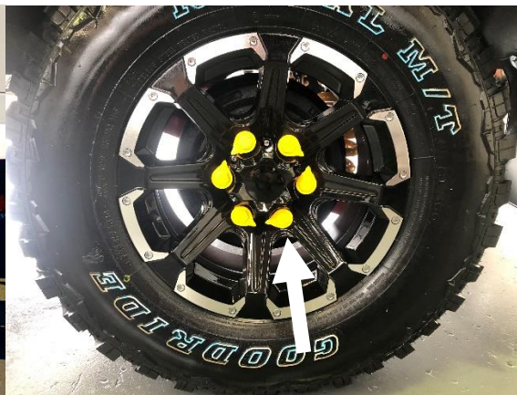
Shown with wheel nut indicators