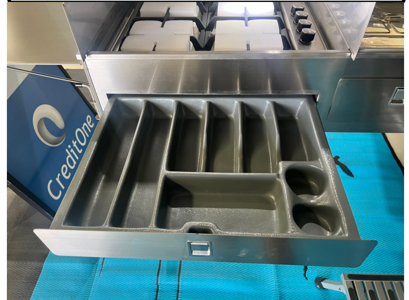
DRAWER MAY NEED TO BE REMOVED