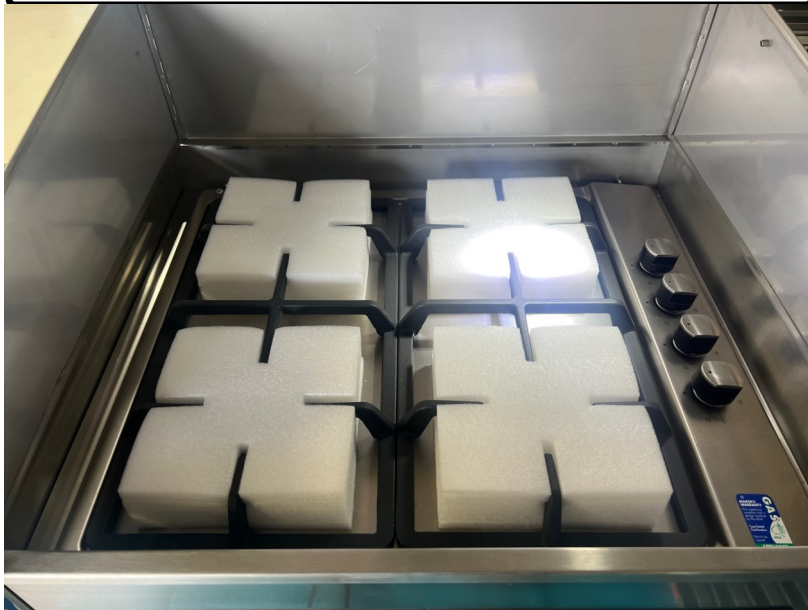
4 BURNER GAS STOVE